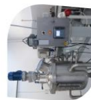
IZRADA LABORATORIJSKIH REAKTORA