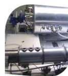
IZRADA PILOT POSTROJEVANJA PO SISTEMU "KLJUČ U RUKE"