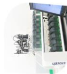
ISPITIVANJE BIORAZGRADIVOSTI I BIOPLINSKOG POTENCIJALA