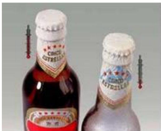
Fig. 2. Intelligent inks that change color with the temperature

Time- temperature indicators or integrators (TTIs) are designed to monitor, record and translate whether a certain food product is safe to be consumed, in terms of its temperature history. This is particularly important when food is stored in conditions other than the optimal ones. For instance, if a product is supposed to be frozen, a TTI can indicate whether it had been inadequately exposed to higher temperatures and the time of exposure. The communication is usually manifested by a color development (related to a temperature dependent migration of a dye through a porous material) or a color change (using a temperature dependent chemical reaction or physical change) (Fig. 2) Timestrip® has developed a system (iStrip) for chilled foods, based on gold nanoparticles, which is red at temperatures above freezing. Accidental freezing leads to irreversible agglomeration of the gold nanoparticles resulting in loss of the red color.