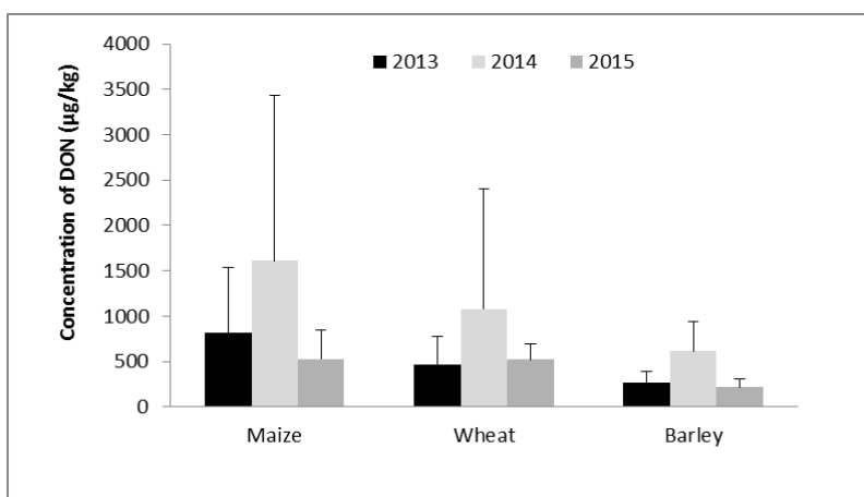
Fig. 1. Concentration of deoxynivalenol (DON) established in various types of cereals in various harvesting years