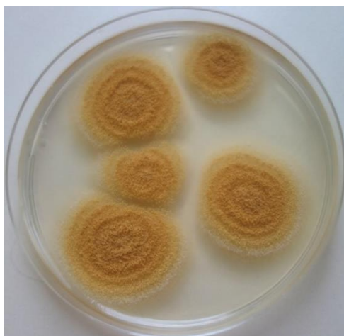
Fig. 3. A. ochraceus on dicloran glycerine (DG) 18 agar