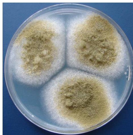
Fig. 2. A. flavus on dicloran glycerine (DG) 18 agar