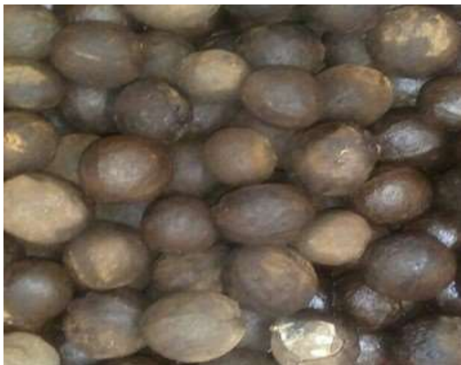
Fig 1. Unshelled African walnut seed

African walnuts seed encourages the possibility of its usage as an ingredient in confectionery products (Awofadeju, 2020). The increase in its utilization is largely due to its excellent nutritional value (Ozdemir and Akinci, 2004). Previous study revealed the protein quality of African walnut protein isolate, wheat and yellow maize flours which could be included in Nigerian diet and food industry (Awofadeju, 2020); the protein quality of bread enriched with African walnut and wheat flours (Awofadeju et al., 2018), and nutritional and organoleptic evaluation of cookies produced from African walnut and wheat flours (Awofadeju et al., 2015). The non-use of this underutilized crop for human food constitutes a real economic loss since it is rich in essential nutrients which can be used as value-added ingredients. Despite its richness in lysine and tryptophan amino acids, it is also deficient in methionine which could be found in wheat and yellow maize. Nevertheless, the process of blending the three crops could bring about improved nutrient through complementation (Potter and Hotchkiss, 2006). These could enhance the wheat products with better nutrients and healthy and good functional characteristics. The aim of this study was to optimize a cereal blend (wheat, yellow maize flours and African walnut protein isolate) for cookie making and evaluate its proximate composition and general acceptability.