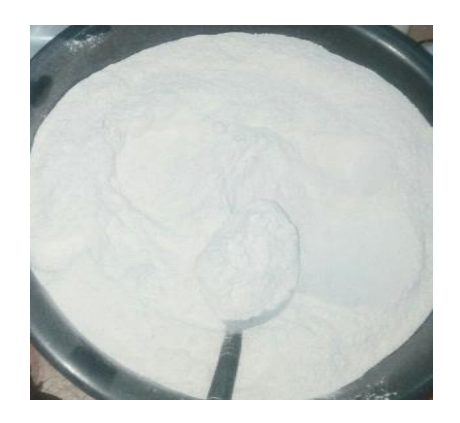
Figure 2. Freshly produced cocoyam flour

Figure 1. Packaging materials: a) PET bottles; b) polyethylene bags; c) woven polypropylene sacks