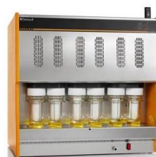
SOXTHERM 416 AUTOMATSKI UREĐAJ ZA EKSTRAKCIJU MASTI