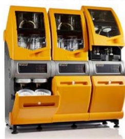
HYDROTHERM HT6 POTPUNO AUTOMATSKI UREĐAJ ZA HIDROLIZU MASTI