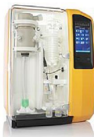
VAPODEST 500 AUTOMATSKI UREĐAJ ZA DESTILACIJU I TITRACIJU